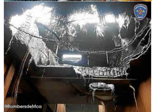
The interior of the vessel.

Luxury yacht catches fire in port: See Page 3