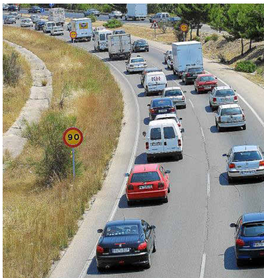
In the slow lane. Concerns over too many vehicles.