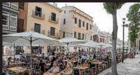
Bars and restaurants had to close earlier from last night in new restrictions.

The foreign ministry was not immediately available for comment. The move would be a major blow for the Majorcan tourist industry.