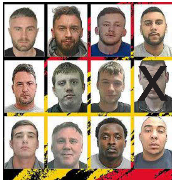
The 12 most wanted men by British police in Spain. Eleven are still on the run.

dog. He is one of 12 fugitives on Britain's most-wanted list. His arrest comes just a day after the UK National Crime Agency and the Charity Crimestoppers, in conjunction with Spanish police, launched a campaign in Madrid to find Britain's most wanted fugitives.